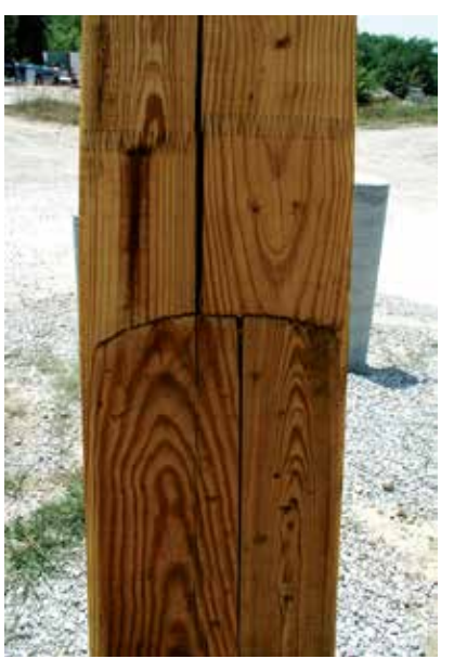
Photo A – Typical unglued edge joint on cut side of pole showing slight checking through thin area of next layup.