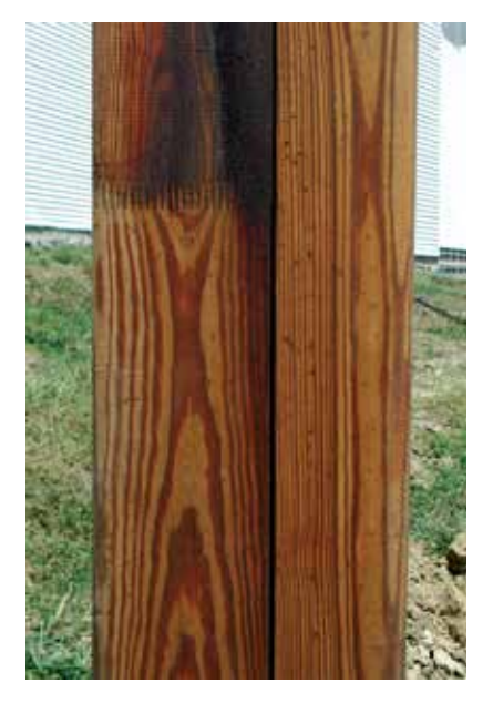
Photo B – Typical unglued edge joint on uncut side of pole which runs the entire length of pole.