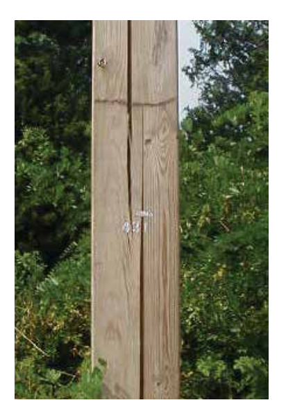
Photo C – Typical unglued edge joint on cut side of pole showing checking through thin area of next layup. Wood treated with CCA is more susceptible to deep checking than wood treated with Oil Borne Preservative.