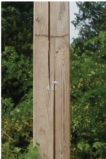
Photo C – Typical unglued edge joint on cut side of pole showing checking through thin area of next layup. Wood treated with CCA is more susceptible to deep checking than wood treated with Penta & Oil.