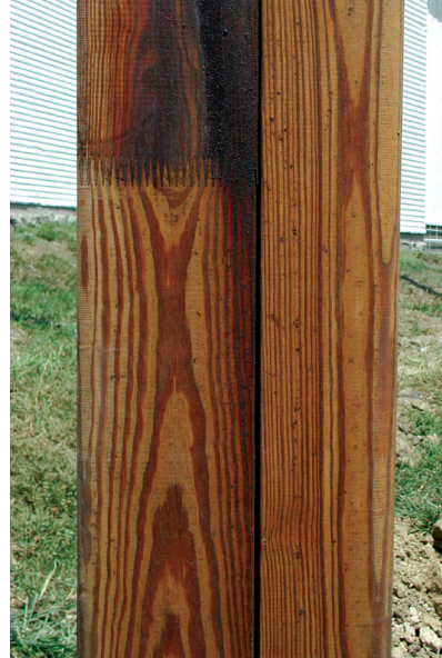
Photo B – Typical unglued edge joint on uncut side of pole which runs the entire length of pole.