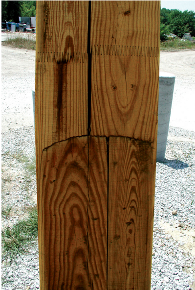
Photo A – Typical unglued edge joint on cut side of pole showing slight checking through thin area of next layup.